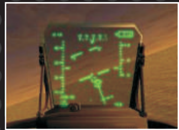
Symbology viewed through HUD